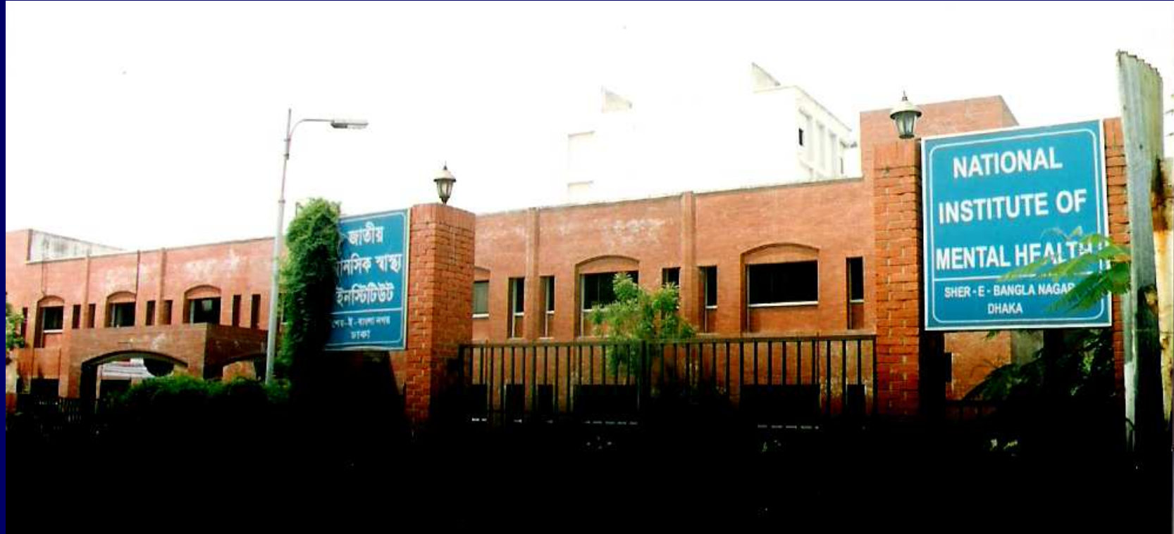
National Institute of Mental Health, Dhaka